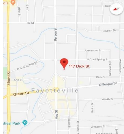
Cumberland County Clerk of Court "Safe Link" Office Cumberland County Courthouse, 3rd Floor Room 340 117 Dick St. Fayetteville, NC