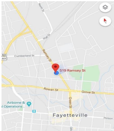
The Phoenix Center 519 Ramsey St. Fayetteville, NC